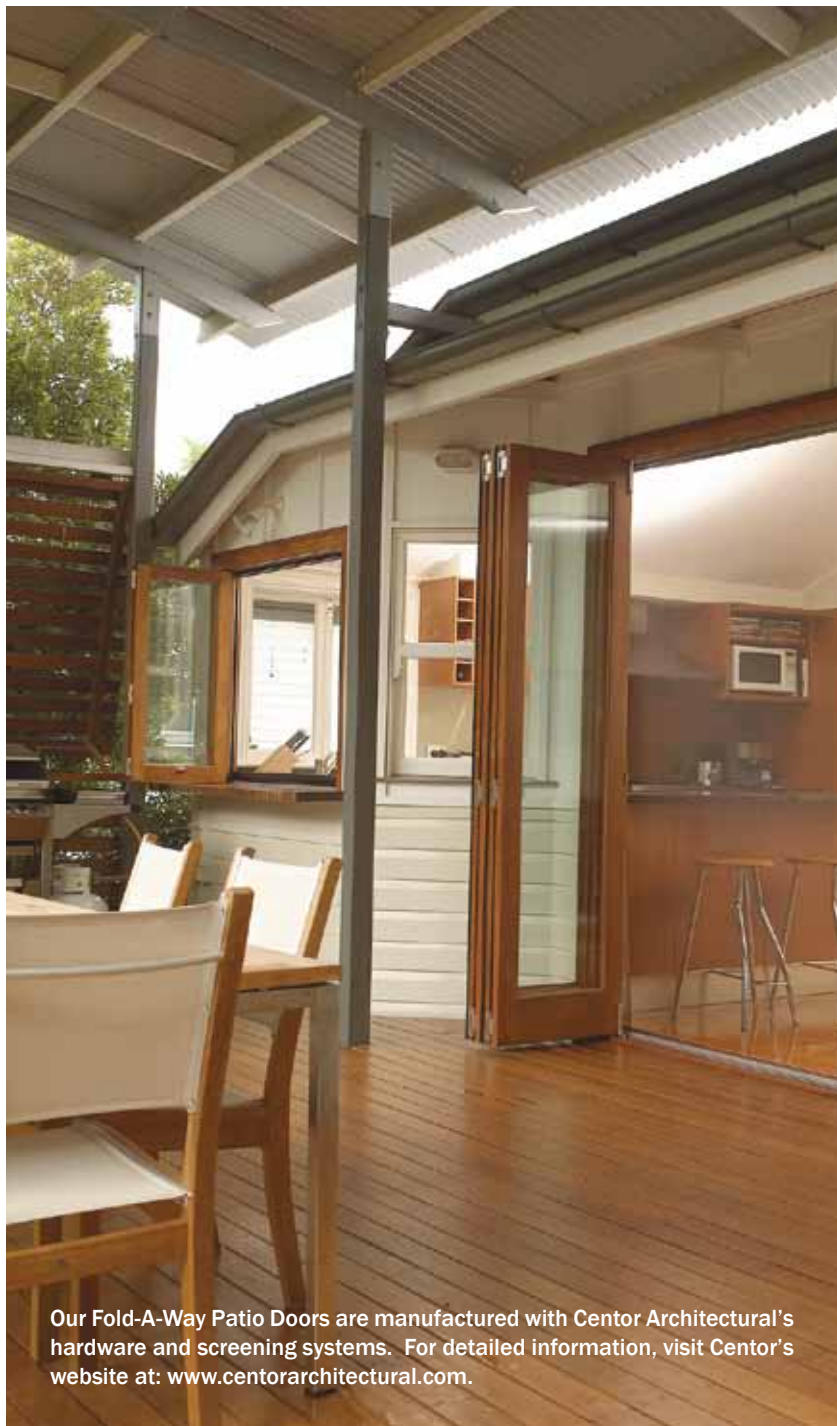
Our Fold-A-Way Patio Doors are manufactured with Centor Architectural's hardware and screening systems. For detailed information, visit Centor's website at: www.centorarchitectural.com .

The screen is manufactured entirely in stainless steel, brass and reinforced engineering polymers. The tough PVC-coated polyester mesh used in the screen is hard wearing, resistant to damage, easy to clean and can be replaced if necessary.